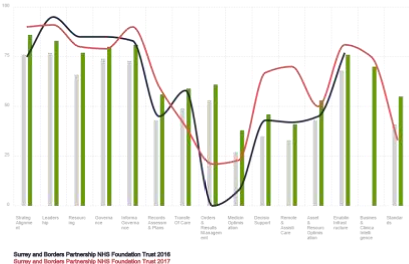
Surrey and Borders Partnership NHS Foundation Trust 2016 Surrey and Borders Partnership NHS Foundation Trust 2017